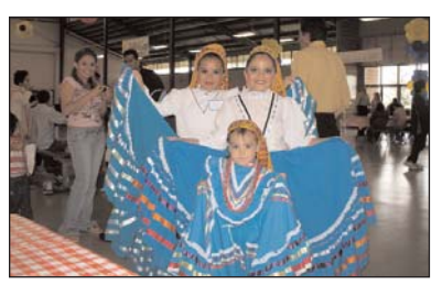
The OUR Center anniversary celebration was a party full of activities and entertainment, including these Hispanic dancers from the community.

city and what the new lack of services would mean to all of the churches. Realizing that people with important needs were turning to churches for help, there was concern that in some cases