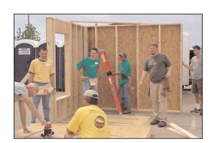
Crossroads Missions and 5 other churches came together and built 6 houses after Hurricane Katrina struck in 2005.

Lexington, KY. After the hurricane struck the Gulf Region, a number of Lexingtonarea churches started meeting on a regular basis to unify their response and assistance. With a history of planting Journey Christian Church together in the New Orleans area, these obviously churches wanted to not only