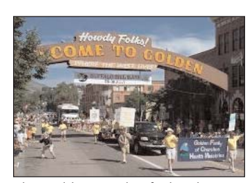
The Golden Family of Churches Health Ministries in Golden Colorado.

Thirty-seven percent of surveyed churches said they partner for medical and/or dental programs in their community. Like the youth ministry partnership, Faith Lutheran Church also has a collaborative effort in the area of health care called the Golden Family of Churches Health Ministries. In this partnership relationship, seven